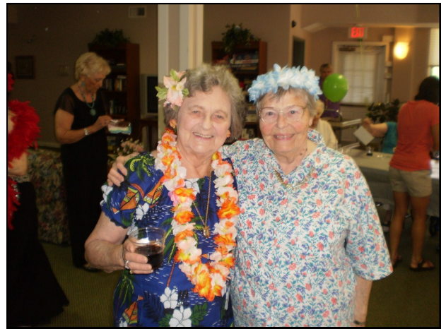
If we can't go to Hawaii, then bring it here.