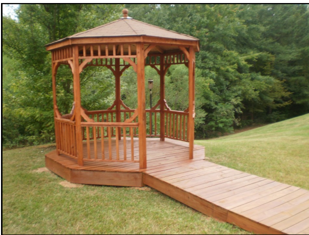
Our New Gazebo!