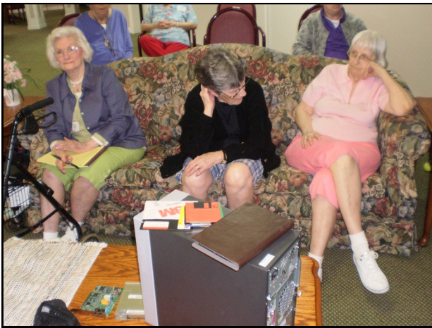
What did he say that thing was? A com-pu-what? (after computer class)