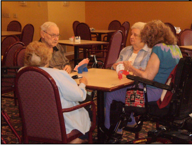
A friendly game of Pinochle