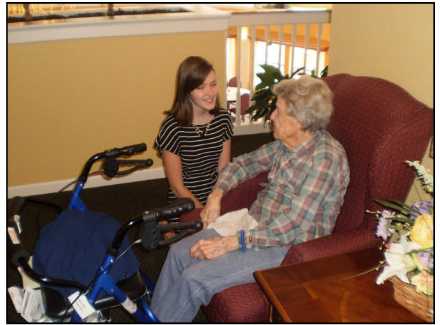
High School Volunteers make good company.